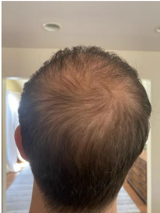
After approx. 12 Weeks