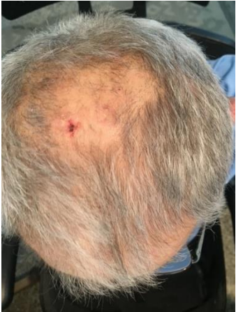
Before Celluma RESTORE