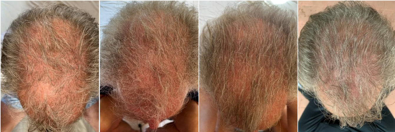
Before Celluma RESTORE

Male age 60 No products, supplements, or other modalities Each photo was taken 4 weeks after a regular haircut