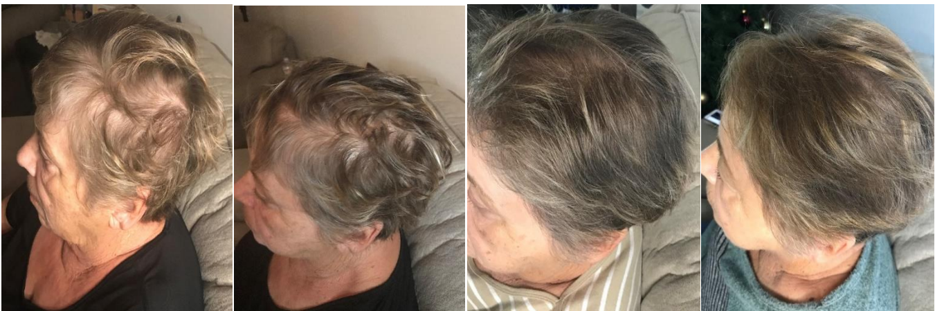
Before Celluma RESTORE

Female age 77 No products, supplements, or other modalities Each photo was taken 4 weeks after a regular haircut