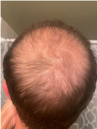
Before Celluma RESTORE (client was resistant to early use)