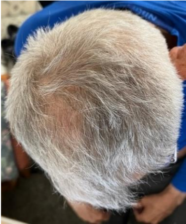
After approx. 10 Weeks